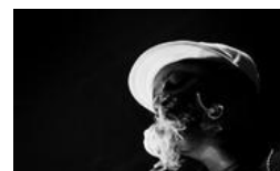
Devin the Dude and Bun B at Warehouse Live

All reader comments are subject to our Terms of Use . By clicking "Post," you acknowledge that you have reviewed and agree to these Terms.