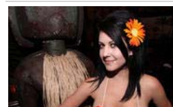
Getting Lei'd at the House of Blues